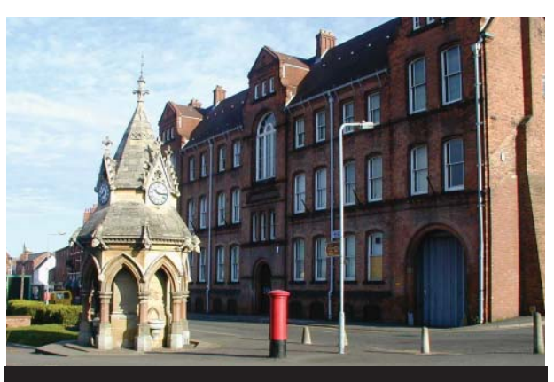
Worcester Street (KTC.3)... all set to change.

One of the key challenges for the SREC will be addressing congestion. The suggestion Whilst retail and new homes may be of a 'Hoo Brook Link' may present a possible solution that needs to be explored further. Such a road link would provide a leisure development will also have an direct route between the A451 and A449 and so would provide better access to the